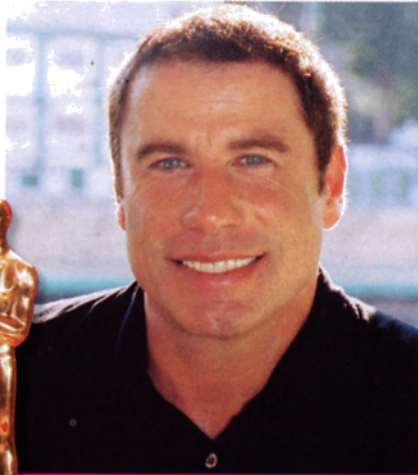
From top: Midler vamps; Travolta grows up; Oscar shines; and Shameless the spaniel takes Best in Show, 2000.